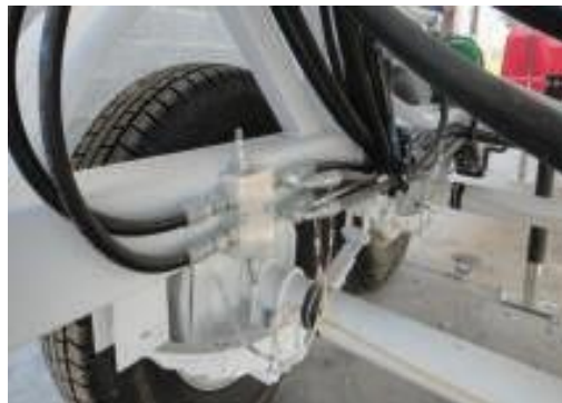
Automatic Braking System with Spring or Torsion Axle