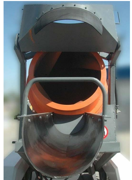
Gravity & Discharge Chutes